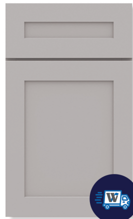
Mineral In Stock & Available for Quickship