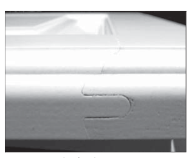
Example of end joint separation

Accordingly, we ask that the following agreement be signed for Paint Finish orders.