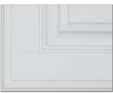
Example of front joint separation