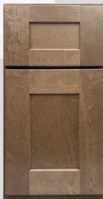
Park Place Smoked Cashew

Solid wood, dovetail, 1/2" plywood bottom and soft close drawer boxes