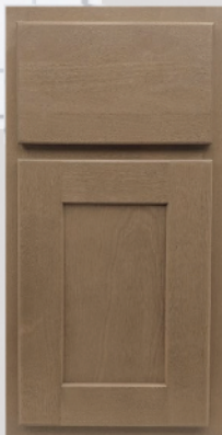
Bella Plus Smoked Cashew