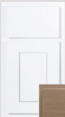
Bella Plus White

FURNITURE BOARD CONSTRUCTION FEATURING SOFT CLOSE DOORS AND DRAWERS