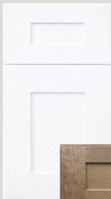
Park Place White